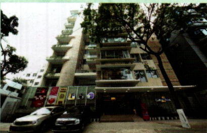
Hotel Bengal Canary Park