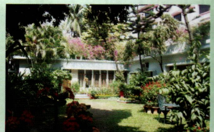
Ambrosia Guest House