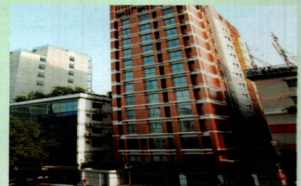
Hotel Platinum Grand