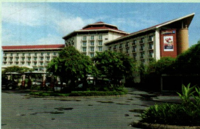
Radisson Blu Dhaka Water Garden

For special rates and reservation Please contact the Conference Secretariat.